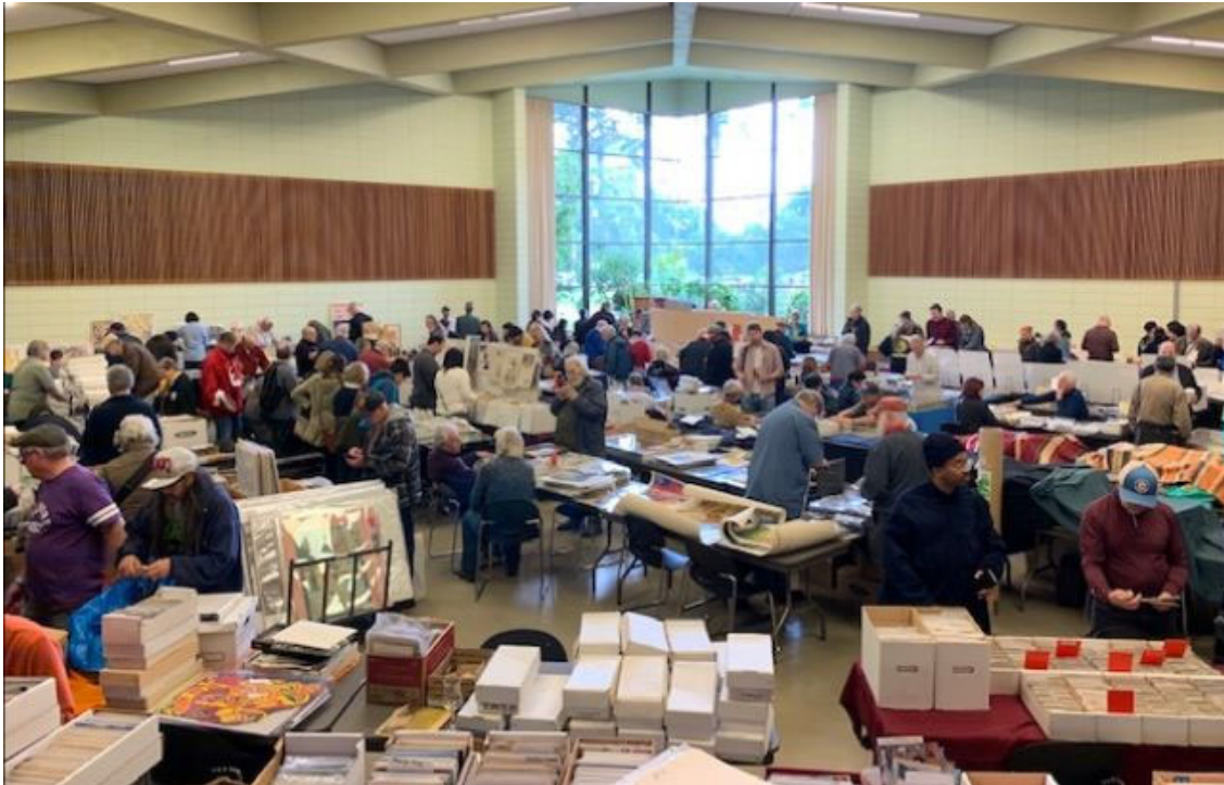
The Vintage Paper Fair in Golden Gate Park in San Francisco on January 4th.