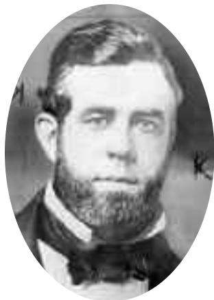
David Colbreth Broderick (1820-1859), was member of the California State Senate from 1850 to 1851 and then elected as a Democrat to the United States Senate in 1857.