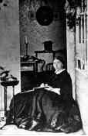
Jessie Benton Fremont (1824-1902), shown here on the porch of her Black Point house, loved the fact that her home was so close to the water. In 1860, she wrote that “the flapping of the sails as the schooners round this point and the noise of their paddles as the streamers pass are household sounds.... It is like being on the bow of a ship.”