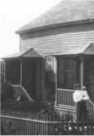
This photograph shows a Fort Mason family sometime around 1900.

In many ways, Point San Jose was laid out and constructed like most late 19th century army posts, which were designed to function as small, self-sufficient towns. The main parade ground, an open, grassy square dedicated to drills, marches, parades, and public ceremonies, was the physical and organizational center of post life. The most significant military buildings, like the post headquarters, the hospital, the barracks, and the mess halls were constructed on a rectangular grid around the main parade ground. However, because the army seized the existing civilian's buildings for officers' housing, Point San Jose evolved differently than standard army posts. Here the officers' homes faced out toward the city, rather than in towards the main parade ground. Also, the historical flagpole was not located in its traditional place in the middle of the parade ground but off to the east side, near the east-facing headquarters building (the flagpole was then later moved closer to Building 201).