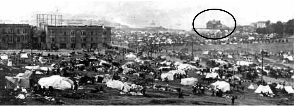
Top photo: This long-distance view (looking northwest) shows Fort Mason's sprawling earthquake-relief encampments. Note, Building 201 (now park headquarters, circled) in the background. Photo circa 1906, courtesy of the San Francisco History Center, San Francisco Public Library.