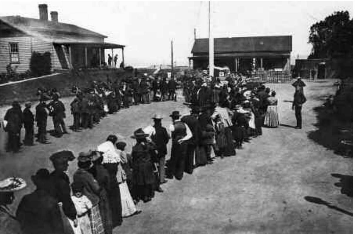
13 Fort Mason History Walk: An Army Post at the Edge of San Francisco